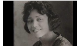
THE INSPIRATIONAL Bessie Coleman