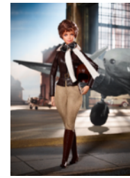
DOLL OF THE MONTH