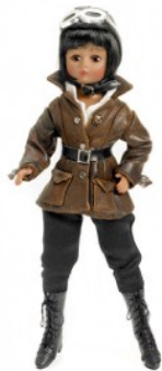
A Bessie Coleman doll