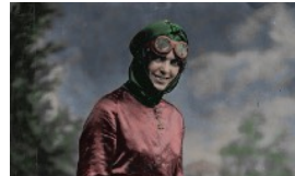
THE AVIATOR IN PURPLE Harriet Quimby